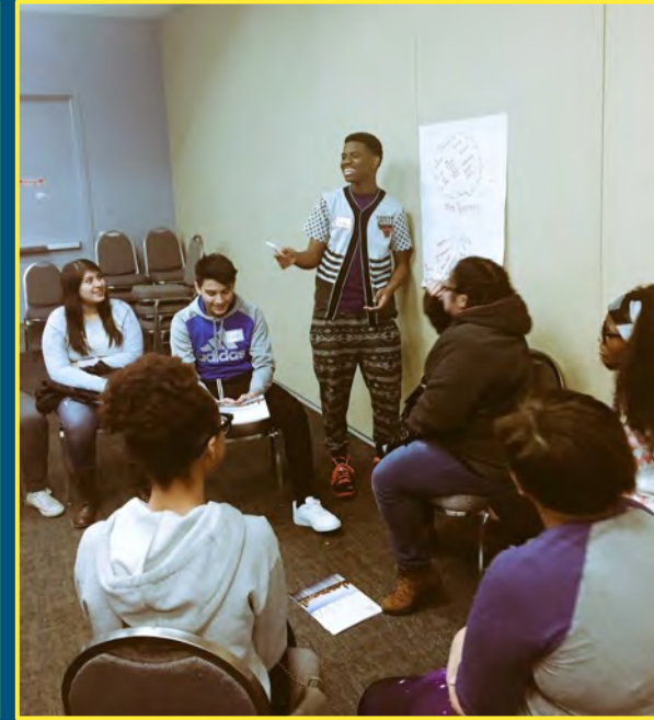
Students Plan and Organize Events at School to Raise Awareness